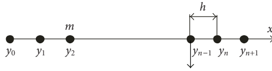
Figure 3.1. Mass chain.

The system of difference-differential equations (3.1) can be given in the following form: