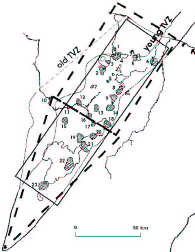
Figure 1. Area estimates for the TVZ. The shaded and labelled areas are the geothermal fields: 1.Taheke, 2.Rotorua, 3.East Rotorua, 4.Rotoiti, 5.Rotoma, 6.Kawerau, 7.Horohoro, 8.Waimangu, 9.Waiotapu-Waikite, 10.Mangakino, 11.Ongaroto, 12.Atiamuri, 13.Te Kopia, 14.Reporoa, 15.Mokai, 16.Orakeikorako, 17.Ngatamariki, 18.Ohaaki, 19.Wairakei, 20.Rotokawa, 21.Tauhara, 22.Lake Taupo, 23.Tokaanu.

the special properties of the TVZ (see Weir, 1998a). The large scale physics of the TVZ have been summarised by McNabb (1975).